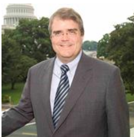
Congressman John Culberson R-TX