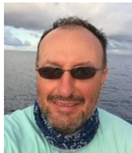
Slava Turyshev, PhD NASA Jet Propulsion Laboratory

Nature has presented us with a very powerful "instrument" that we have yet to explore and learn to use. This instrument is the Solar Gravitational Lens (SGL), which results from the ability of the gravity field of the Sun to focus light from faint, distant targets. In the near future, a modest telescope could operate on the focal line of the